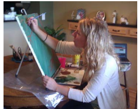
Painting in Minnesota

In this next season, I will be setting up things for the January DTS, as I will be leading it again next year. I am also taking on a new role for the next couple of months ... I will