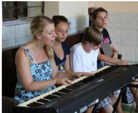
Nursing Home Ministry

For most of the month of August, I was home visiting family and friends. I forgot how busy Minnesota summers can be but I had a lot of fun! After finishing DTS and working in the kitchen for a few weeks with several teams coming through the base, I was ready to go home and have some relax time. I also worked on raising more support this year and I got at least 3/4 of the way there! It was very encouraging getting to meet so many of you and hearing what you've been up to and also