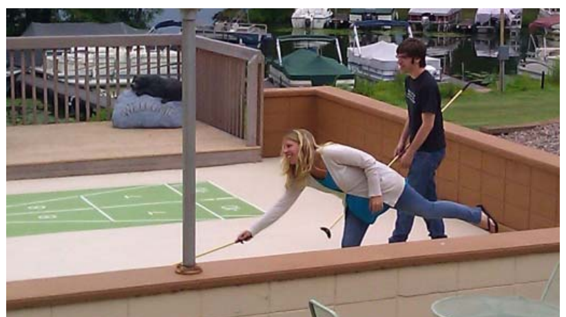
Shuffle boarding with my brother